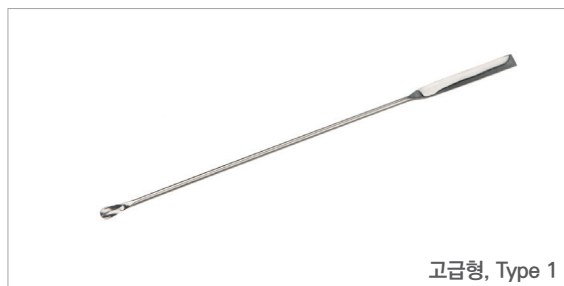
고급형, Type 1