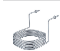
CC1 Cooling Coil