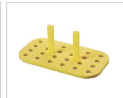
Floating Tube Rack