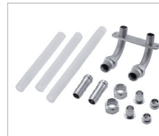
Pump Connection Set