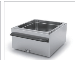
Stainless Steel Bath