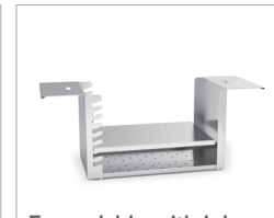
Expandable with Inlay 1~3