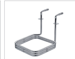
CC2 Cooling Coil