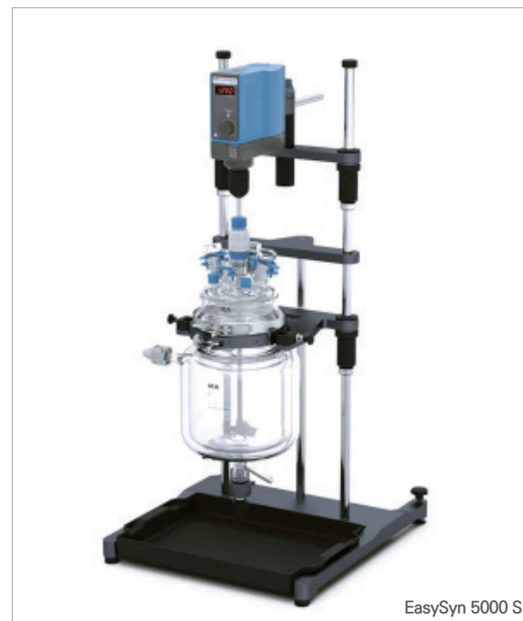
EasySyn 5000 S