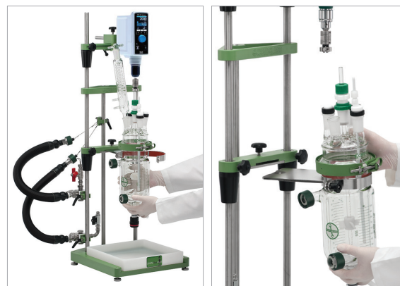
Unique clamp and support system provides simple installation and quick change-out