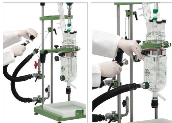
Tool-Free Jacket fittings with hose hanger incorporated into CHEMRxnHUB