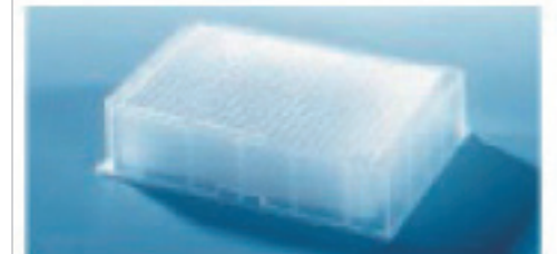
384-well deep well plate up to 0.3 ml