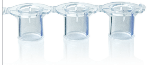
Insert strips, smooth-walled