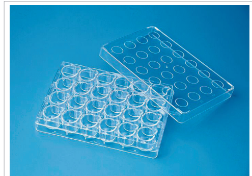
24-well standard plate