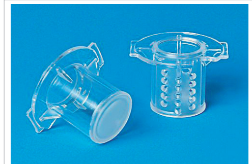
Insert strips with special inlet channels (the Inlet Opening System*)