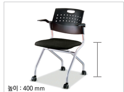
높이 : 400 mm