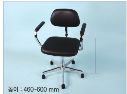
높이 : 460~600 mm