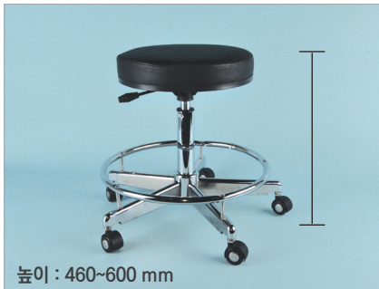
높이 : 460~600 mm