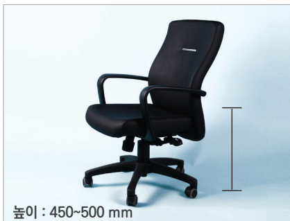
높이 : 450~500 mm