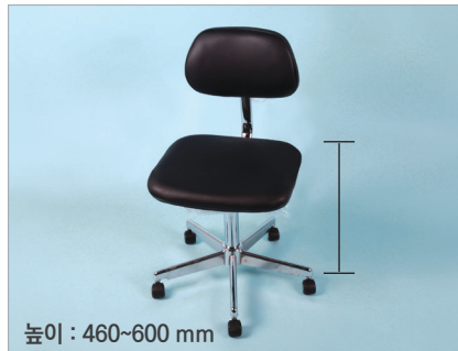
높이 : 460~600 mm