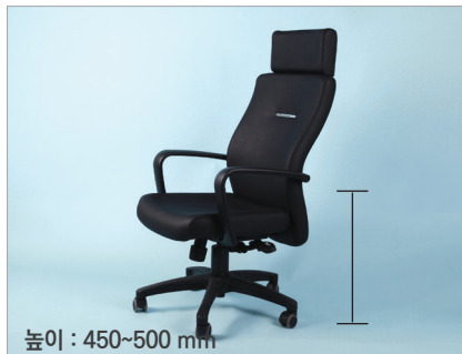
높이 : 450~500 mm