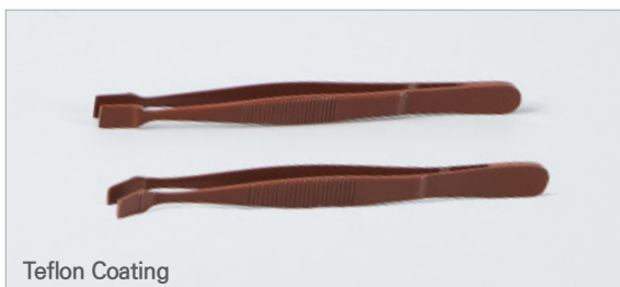
Plate Forcep 플레이트용 핀셋