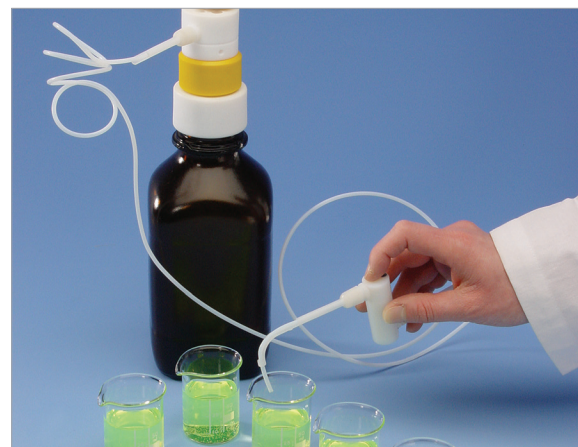
Flexible Universal Drain Tube