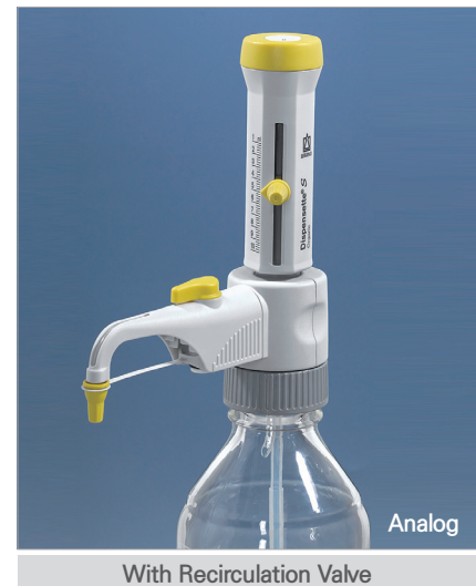
With Recirculation Valve