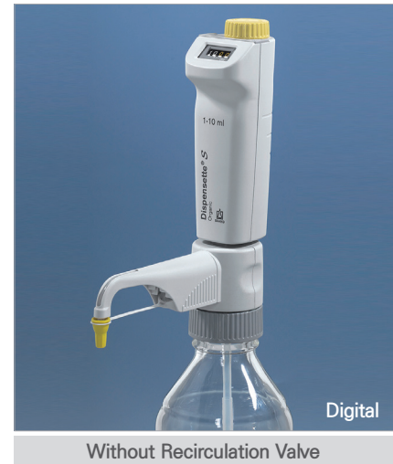
Without Recirculation Valve