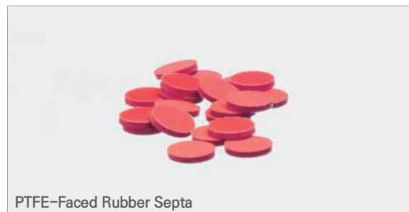
PTFE-Faced Rubber Septa