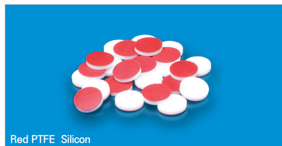
Red PTFE Silicon