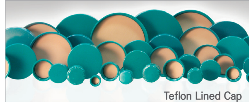
Teflon Lined Cap