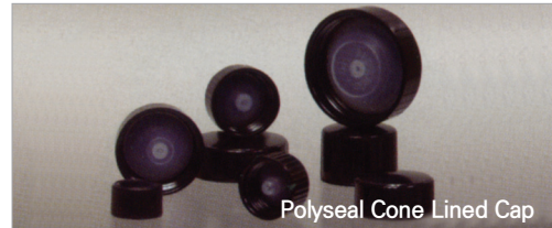
Polyseal Cone Lined Cap