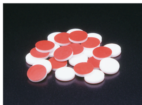
Red PTFE / White Silicon

• JGF (J. G. Finneran) / Certified (품질 보증서 포함)