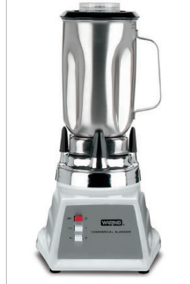
B type - 속도 가변형, SUS