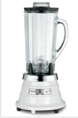
A type - 속도 고정형, Glass