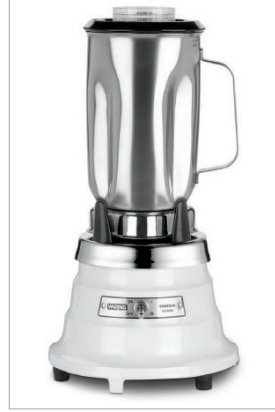
A type - 속도 고정형, SUS