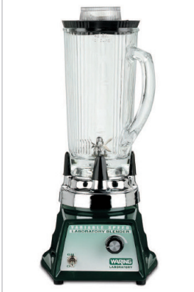
C type - 속도 가변형, Glass