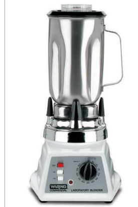
D type - 속도 가변형, SUS