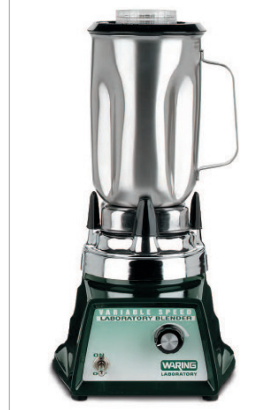
C type - 속도 가변형, SUS