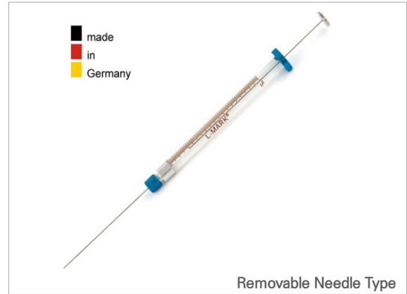
Removable Needle Type