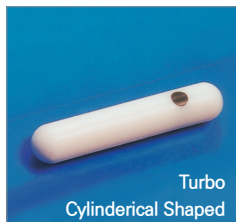
Turbo Cylindrical Shaped