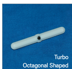
Turbo Octagonal Shaped