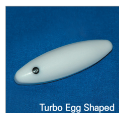
Turbo Egg Shaped