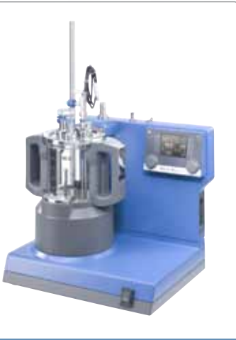
LR 1000 control Package