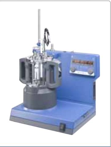
LR 1000 basic Package