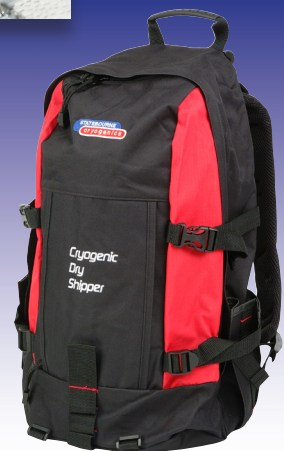
Backpack for the Biotrek 3. Part Number 9701011.