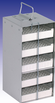
Cryobox rack system (5x 100 cell cryoboxes). Part Number 5801272.