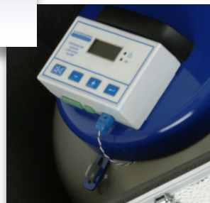
Temperature Alarm and Datalogger. Part Number 9701321.