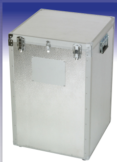
Shipping Case Biotrek 3. Part Number 9701178.